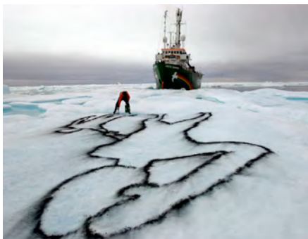
Arctic peace drawing in charcoal near US military base.